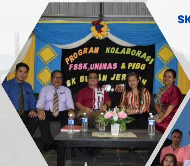
SK Bulan Jeragam & the Parents Teachers Association