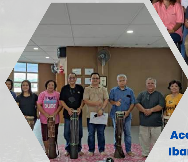
Academy Sarawak Dayak Iban Association (ASADIA)