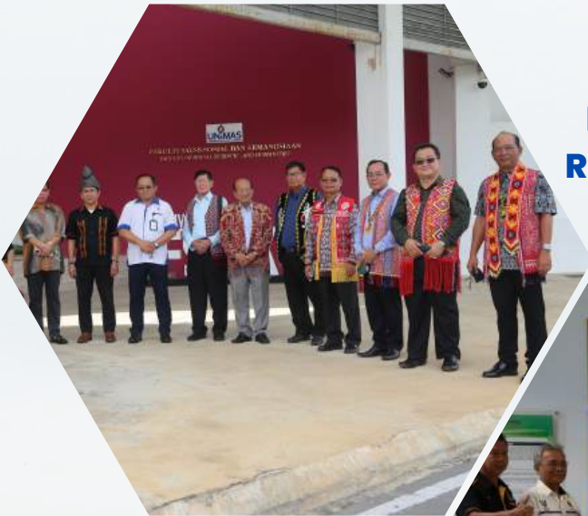
Persatuan Ketua Masyarakat Dan Tuai Rumah Daerah Kuching (PEMAIK)