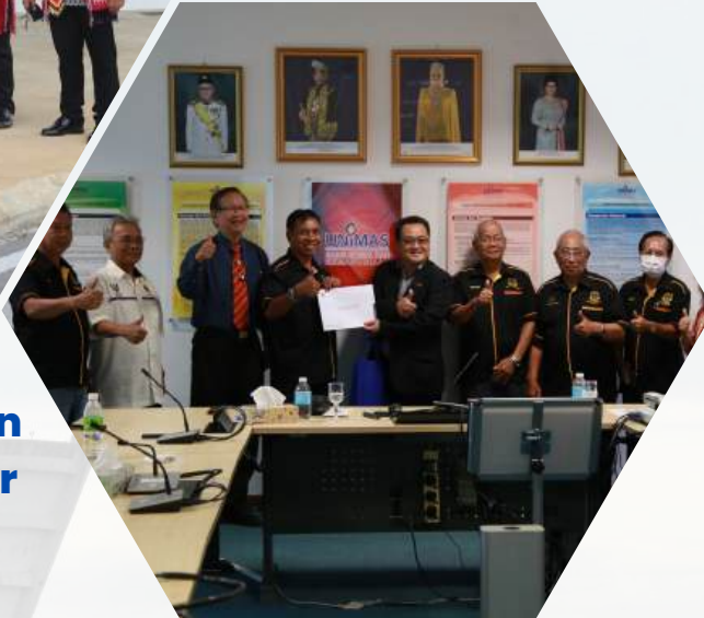
Persatuan Veteran Tentera Kor Renjer (PVTKR)