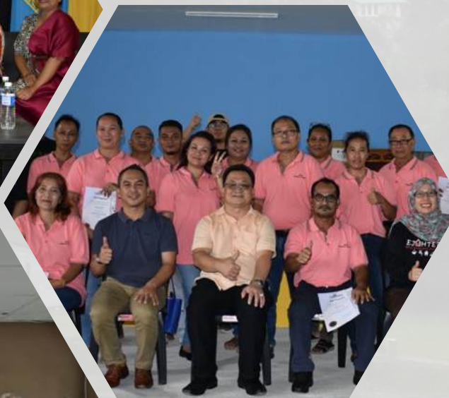
JKKK Sebayor, Kota Samarahan