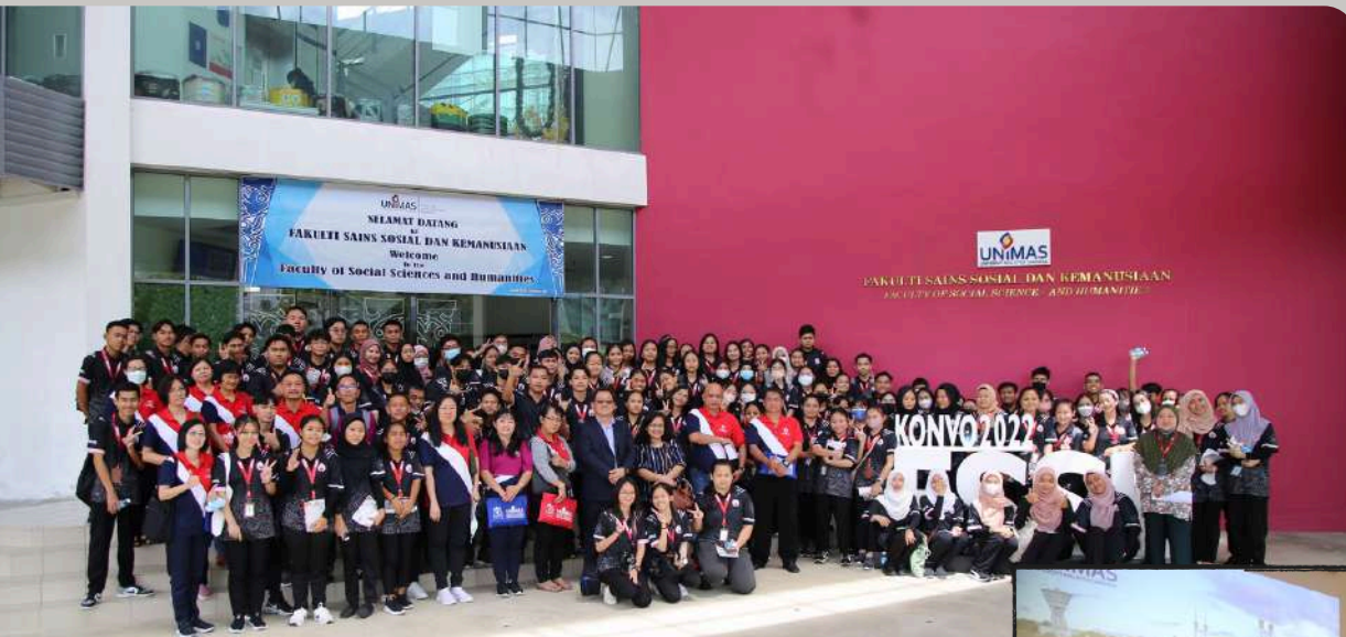
3 MAY 2023: SMK SIMANGGANG