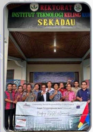
A visit and sharing session at Keling Kumang Institute of Technology, Sekadau, Kalimantan Barat (March 2023)