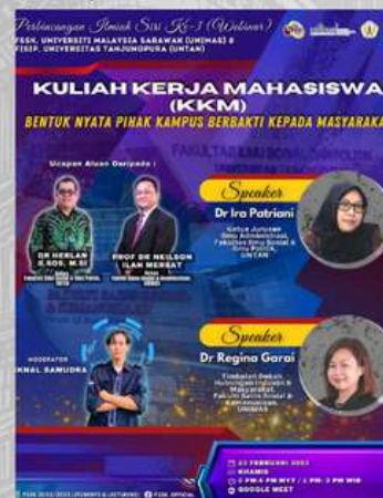
An online sharing session by both FSSH and UNTAN speakers. It was attended by staff and students from both universities