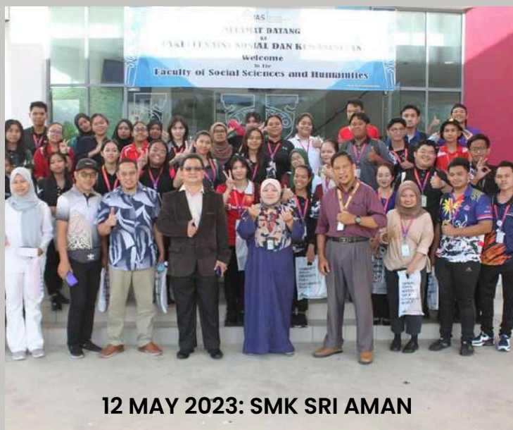
12 MAY 2023: SMK SRI AMAN