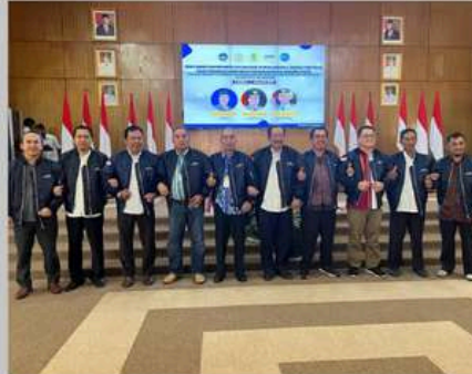
At the launching of KKN in Sambas, West Kalimantan (January 2023)

The Faculty of Social Sciences and Humanities has proactively lay the foundation for fostering enduring collaborations with our neighbouring region, Kalimantan.