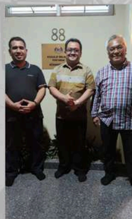
Close networking with Malaysian Consulate in Pontianak