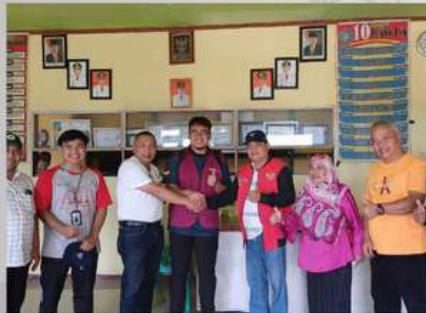
FSSH students participating in KNN 2023