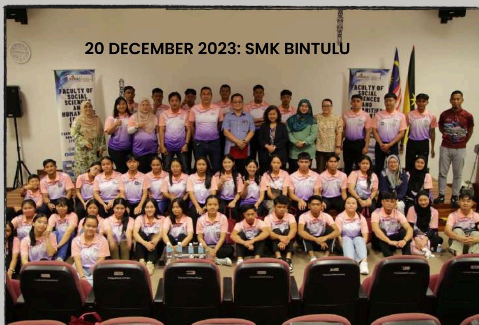
20 DECEMBER 2023: SMK BINTULU